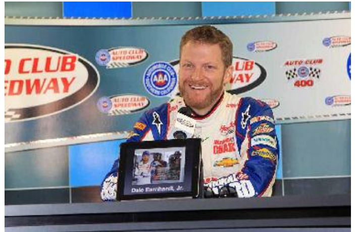
The real Dale Earnhardt prior to the Auto Club 400