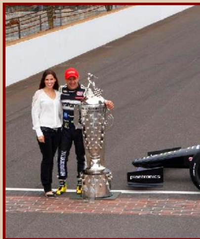
Tony Kanaan with his wife after winning the Indianapolis 500-