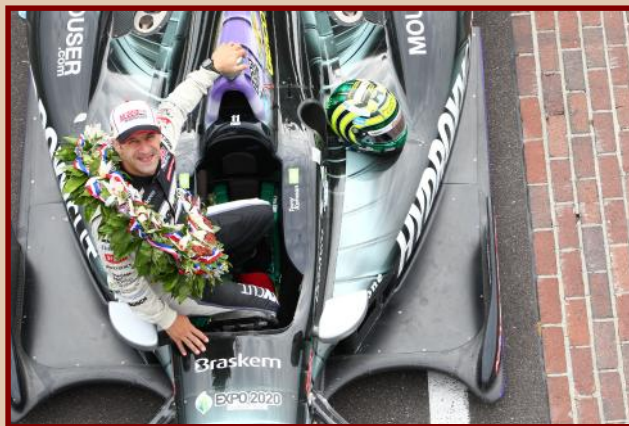
Tony Kanaan on the Yard of Bricks --