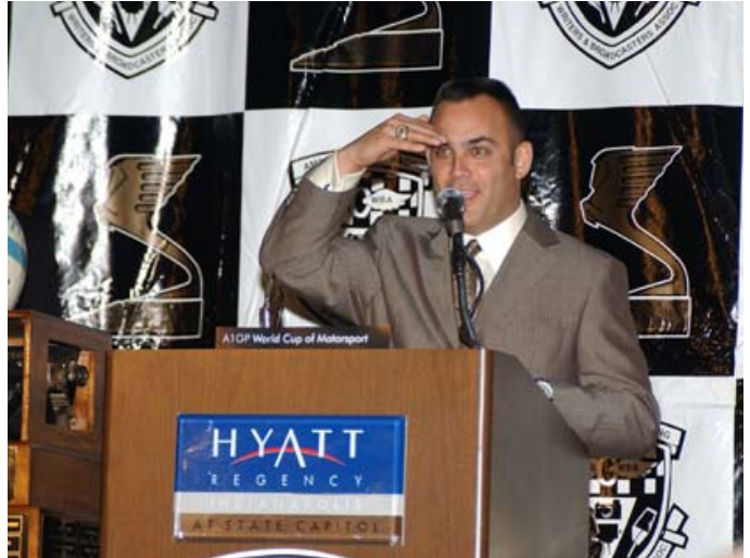
Top Fuel champ Tony Schumacher entertains the audience from the podium