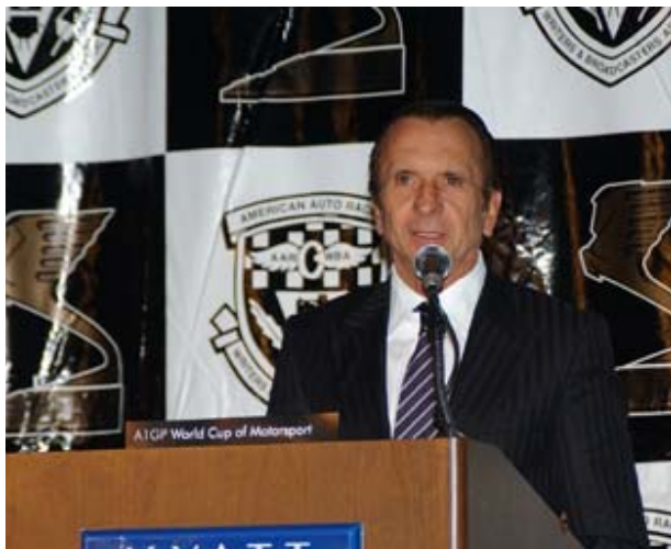
Featured Speaker Emerson Fittipaldi wows the audience