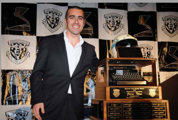
Dario Franchitti with AARWBA's highest honor, the Jerry Titus Memorial Trophy