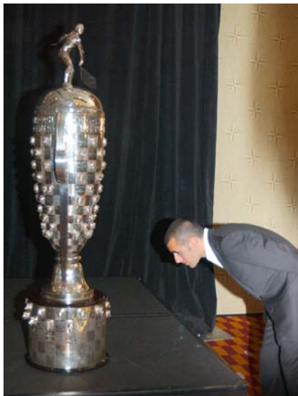
Dario Franchitti studies his image on the Borg-Warner Trophy