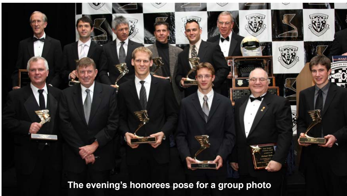
The evening's honorees pose for a group photo