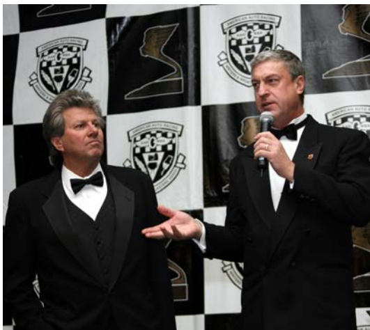
John Force answers a question from MC Bob Jenkins