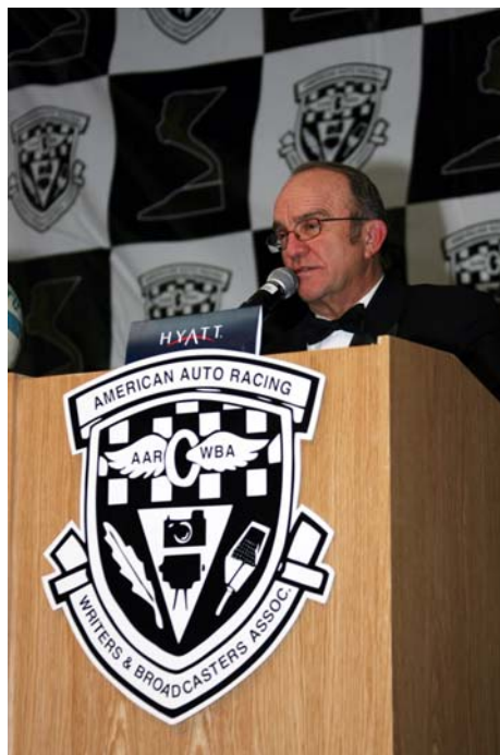
Jack Roush, the featured speaker, shares his insights

* Many attendees said they saw a side of Jack Roush never before revealed in his comments near the end of his featured speaker role. Jack also addressed NASCAR's Car of Tomorrow, team ownership restrictions, and gave a team-by-team run-down of his plans for 2007.