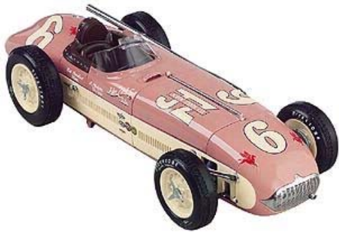
1955 Kurtis-Kraft Model